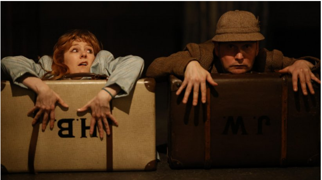
A nice crime thriller: "The Hound of the Baskervilles" at the English Theater.